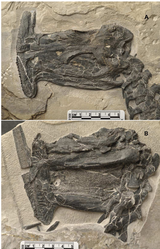
Fig. 1. Prepared skulls referred to the Middle Triassic marine reptile A. unicus . (A) IVPP V20291 exposed in dorsal view. (B) IVPP V20292 exposed in ventral view. Scale bar, 2.0 cm.

Behind the skull, and oriented at a sharp angle relative to the long axis of the skull, lies a string of four cervical vertebrae and associated cervical ribs. The anterior-most of these cervical vertebrae displays a broad, crescent-shaped neural spine, indicating that it represents the axis. The atlas centrum is preserved right in front of it, apparently without any cervical ribs in association with it. The right cervical ribs associated with the axis and the succeeding cervicals overlap and thus obscure both the posterior margin of the dermal palate and the contact of the pterygoids with the quadrate.