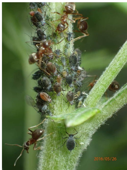
Fig. 1. Color polymorphism in M. yomogicola and attending ant, L. japonicus . Large black aphids and small green ones are green morphs, whereas large and small orange and brown ones are red morphs.

Here, we investigated a color polymorphic mugwort aphid ( Macrosiphoniella yomogicola ; Fig. 1) that is attended by ants. Because ants attend this species, M. yomogicola should not experience strong predator-mediated selection. Thus, the coexistence of the two color morphs in this species cannot be explained by frequency-dependent predation. We should also note that the two color morphs cohabit sympatrically on a mugwort shoot (Fig. 1). This means that the balancing selection of two opposing selection pressures is not likely to explain this polymorphism, because the environmental heterogeneity that is required to maintain this type of polymorphism is unlikely to take place. Polymorphism by overdominance is also unlikely in this case, because the two color morphs reproduce parthenogenetically during the observed spring-summer seasons. Therefore, the former three hypotheses are not likely to explain the color polymorphism in M. yomogicola . Thus, we hypothesized that the color polymorphism in M. yomogicola is maintained by the attending ants because they prefer aphid colonies with a specific ratio of the two morphs. To test this hypothesis, we measured the preference of the ants to the aphid colonies with different proportions of the two morphs. We initially evaluated the effects of attending ants on the survival of the aphid colonies by experimental removal of the ants. We show that the attending ants are necessary for the persistence of the colony. We then