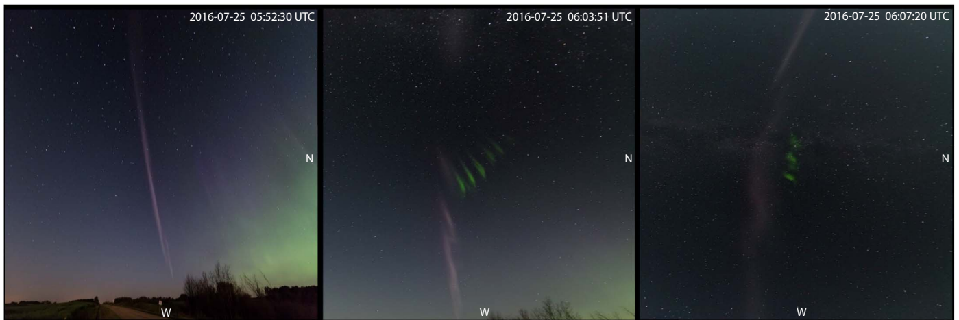
Fig. 1. An observation of the subauroral arc (purple) known as STEVE, recorded on 25 July 2016 (05:51 to 06:10 UT) from Regina, Saskatchewan. The arc is located \sim 4^\circ equatorward of the main auroral oval [green glow, bottom right in (A) and (B)] and runs across the sky in the east-west direction. Small green auroral features, resembling a picket fence, are also observed in (B) and (C). All images in the sequence can be found in the video linked to in the Supplementary Materials.

aurora is the manifestation of proton precipitation in our atmosphere and is typically observed at auroral latitudes ( \sim 65^\circ MLAT); the location of the arc reported here is at lower latitudes. During 2015 and 2016, these independent citizen scientist auroral photographers captured hundreds of images of the subauroral arc on at least 30 dates. In many cases, multiple independent observers recorded the arc, thus increasing data quality. Observations typically corresponded to nights of enhanced auroral activity predicted over Alberta, either strong substorms or geomagnetic storms of any magnitude. The arc is typically observed during pre-midnight hours [in magnetic local time (MLT)], lasting for approximately an hour. With no accurate scientific classification for the arc available, the citizen scientists named the arc “Steve” in place of the misnomer proton arc (15). Later in 2016, Steve was given the backronym “Strong Thermal Emission Velocity Enhancement” (STEVE) because of data obtained from the satellite measurements reported below.