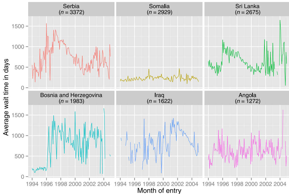
Fig. 3. Wait times for asylum decision vary by origin country and month of arrival. The average wait times for the asylum decision in days by month of arrival for refugees from the top six sending countries.