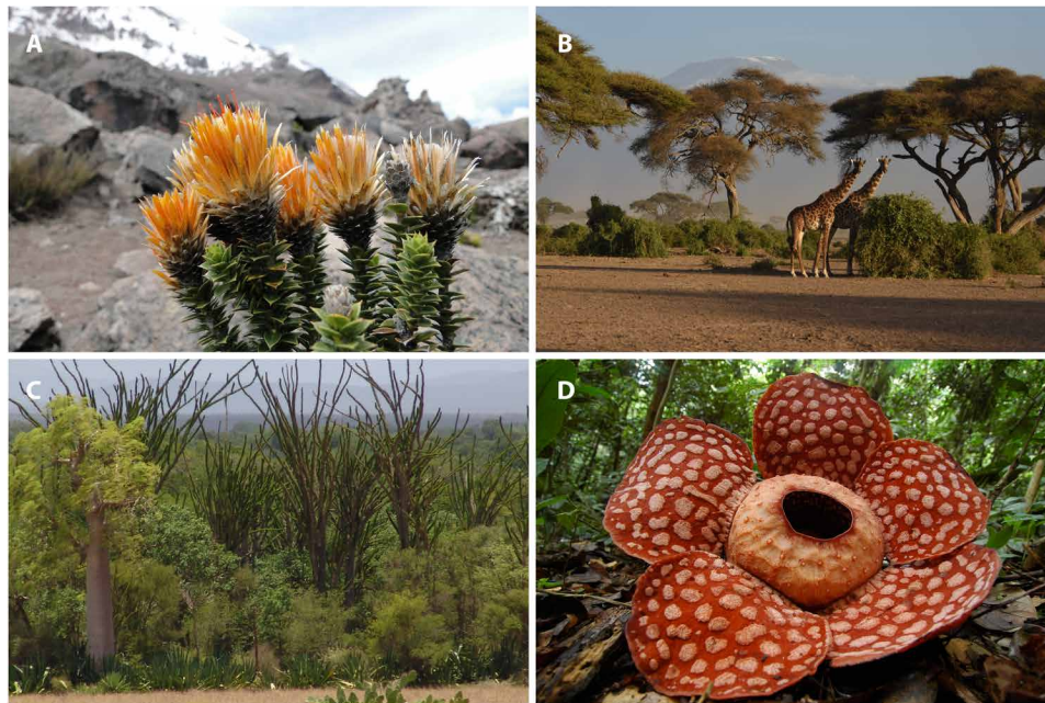
Fig. 2. Plant species from the Andes Mountains, East Africa, Madagascar, and Malaysia. (A) Chuquiraga jussieui at the base of volcano Chimborazo, Ecuador. (B) Vachellia tortilis ( Acacia tortilis ), grazed by giraffes at the foot of Mt. Kilimanjaro. (C) Alluaudia procera spiny thicket, Berenty, Madagascar. The family Didieriaceae is highly characteristic of Madagascar. Moringa drouhardii on the left, and noxious introduced Opuntia stricta in the foreground. (D) Rafflesia cantleyi , a unique parasitic plant, northern Malaysia rainforest.

fewer species than do tropical moist forests. As they expanded, they greatly reduced Africa's moist forests and left many of them as separate patches [e.g., (31)]. The separation of South America from Antarctica about 55 million years ago, eventually leading to the formation of ice sheets in the south, strongly cooled the Benguela Current, running up the west coast of Africa, and caused the spread of arid climates there too. The original rainforest, now much smaller and fragmented, also became much poorer in species of plants and animals than it had been originally (26).