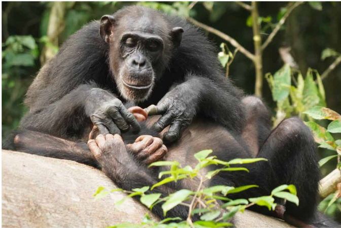
Fig. 2. Mother, Sumatra, grooming her 9 year old son, Solibra.

female baboons, maternal loss in the juvenile period is known to affect later survival (7). Here, we show specifically that the mother's presence during immature periods provides reproductive benefits to sons, apparently at least in part by enhancing their ability to out-compete other males in siring offspring. Additional studies with larger datasets could determine, first, if sons orphaned at younger ages experience greater deficits and, second, if orphans adopted by others, as can occur in chimpanzees (53), experience fewer deficits.